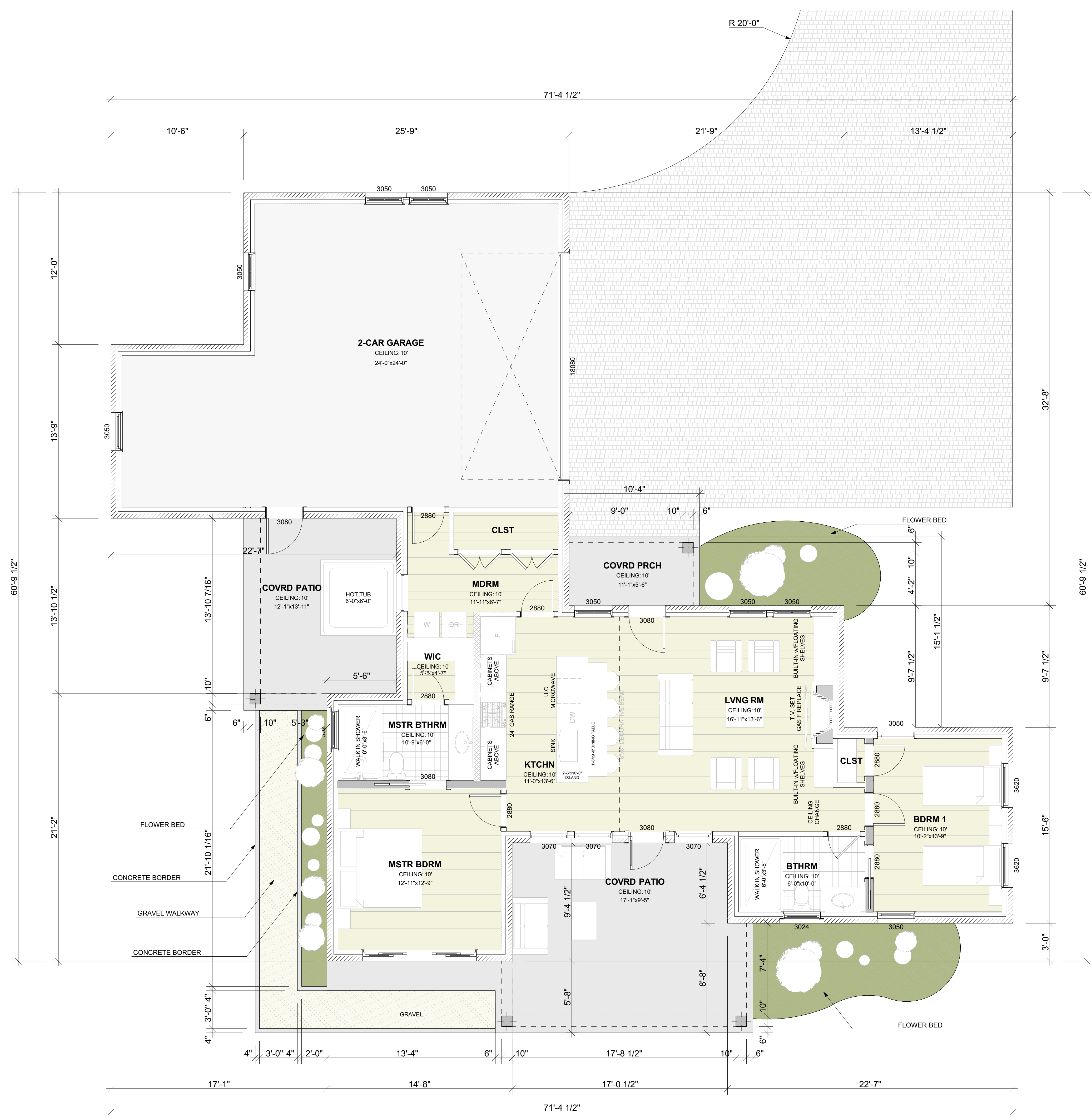
1 MAIN LEVEL LAYOUT PLAN SCALE: 1/4" = 1'-0"